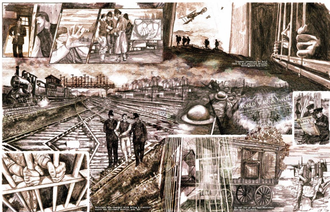
Figure 3: Copyright Kremena Dimitrova and Bishop's Stortford Museum

The washed out sepia of the graphic novels and panels convey both the utter exhaustion caused by the conflict as well as the emotionally charged and tumultuous atmosphere of the times, as can be seen in the picture below. The colour of the walls, painted grey, represents the dismal and monotonous effect of war. Likewise, the handwriting on the panels is made small and intimate in order to engage the visitor's sympathy. Finally, the room's sparse yet bright lighting is, occasionally and depending on where one stands within the exhibition space, suggestive of an interrogation lamp. In their totality, these elements shift the exhibition away from a fully coherent and chronological narrative towards a rather more disjointed atmosphere, deliberately engendering a sense of unease and negative emotional responses that reveal the horrors of the war to the museum visitor, thus bringing the police stories vividly to life (see Figures 3 and 4).