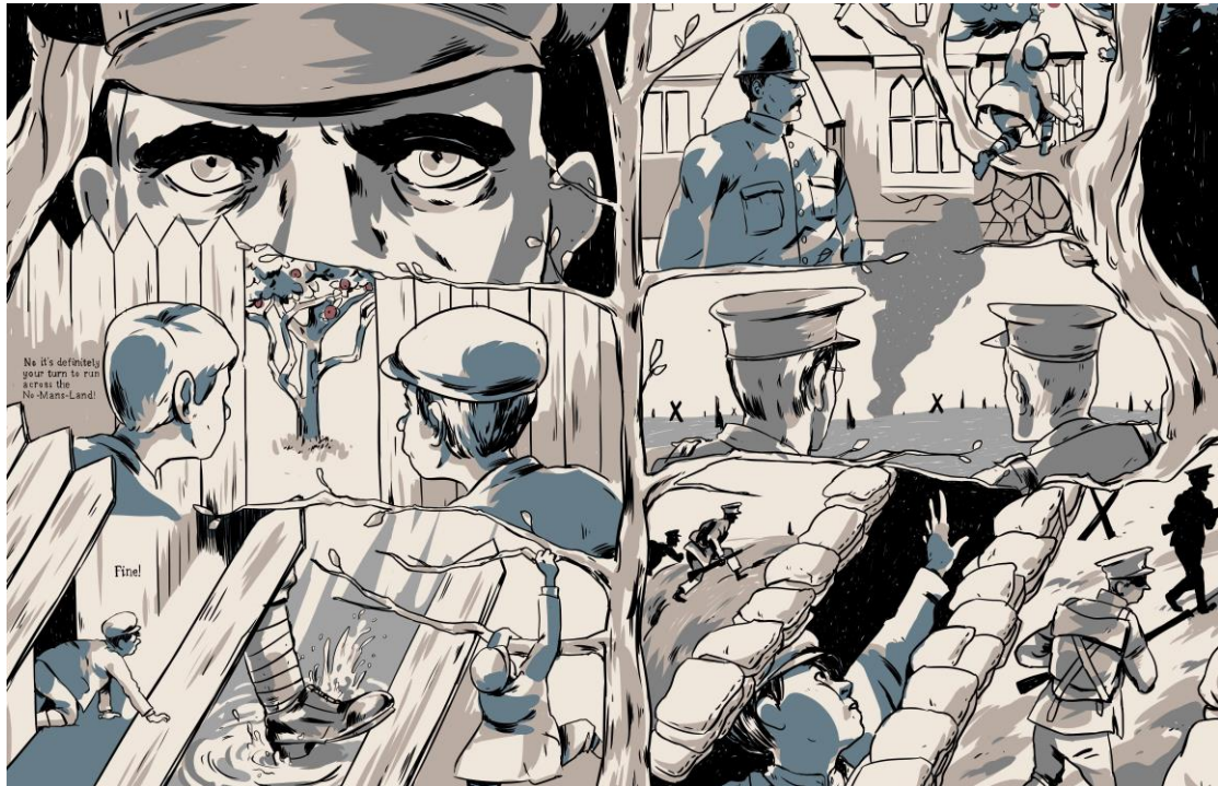
Figure 2: Copyright Michael O'Brien and Bishop's Stortford Museum

experience literacies. 15 Thus, literacy can no longer be understood as a single, knowable quantity that is both narrow and standardised, but rather it encompasses many different perspectives, including that of the graphic novel. In this case it conveys a very visceral, immediate and easily accessible sense of the catastrophe that the war brought to a small English town, enabling communication of the stories that lie penned within the police records (see Figure 2).