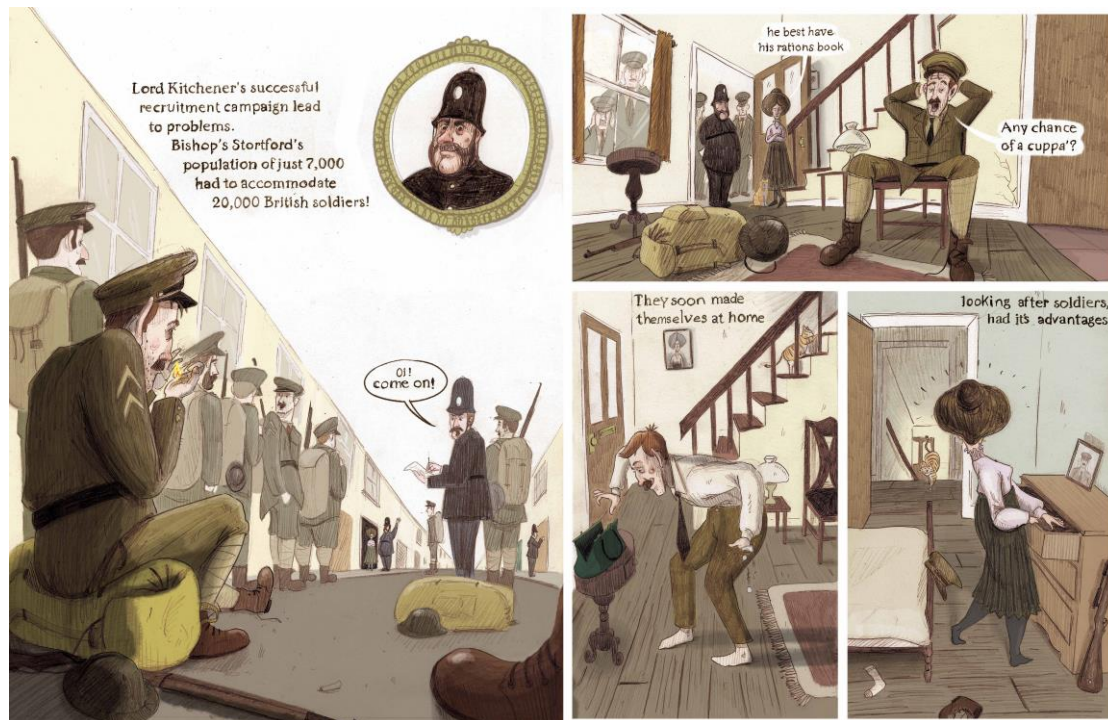
Figure 4: Copyright Daniel Duncan and Bishop's Stortford Museum